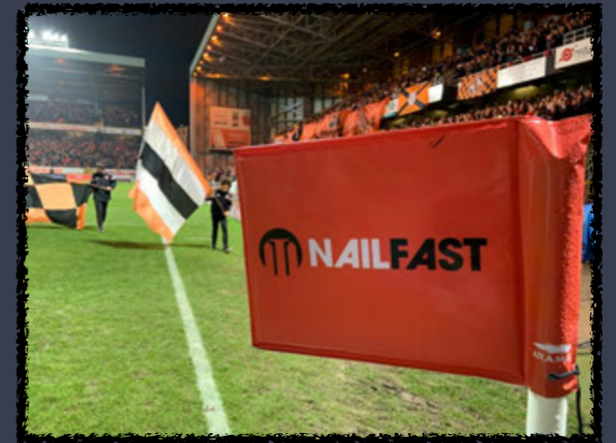
Corner flags sponsor £3000