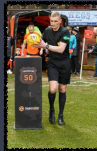
Ball tower sponsor £2000

There are many unique opportunities to sponsor Dundee United for the season at Tannadice, which will elevate your business to the next level, giving you mass exposure on a national and international scale.