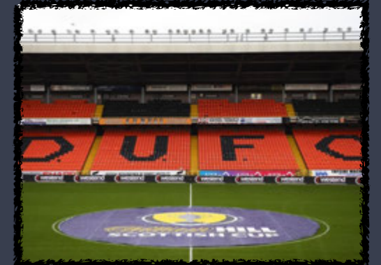
Pre match giant centre circle Sponsor package £7000 - Includes, tannoy announcements and big screen adverts