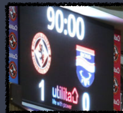
Big screen adverts £3500 - 4 adverts per match